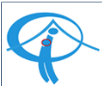
Central Social Welfare Board