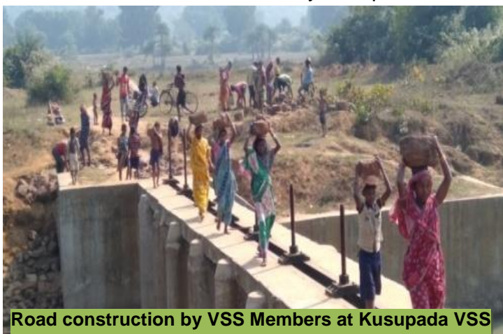
Road construction by VSS Members at Kusupada VSS

NYSASDRI has successfully completed the first year as P-NGO with the Odisha forestry Sector Development Project-II (OFSDP-II) in Dhenkanal Forest Division and also renewed the contract for the 2nd year (Dec-2018 to Nov- 2019) in the month of December 2018, and subsequently 2nd team was deployed in Hindol