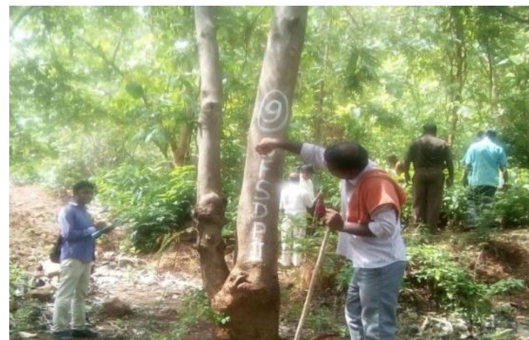
Survey demarcation of Forest area at Sarakhia VSS