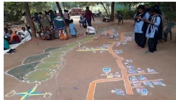
PRA Exercise for Micro planning at Kusupada VSS

meetings created influence in the local people by which many developmental activities performed in the field area. Many developmental plans proposed in the micro planning process prepared by the local people for sustainable development of the forest