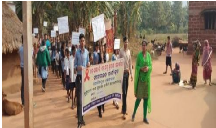
Observation of World Aids Day at Kusupada VSS

Working this short period with OFSDP-II the P-NGO, NYSASDRI and its staffs gained lots of experience in forestry sector and created a good platform in the project implementing areas as well as the team developed good relationship with community members as well as the line departments of the District.