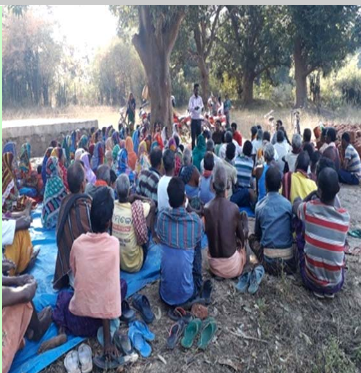
Palli Sabha at VSS