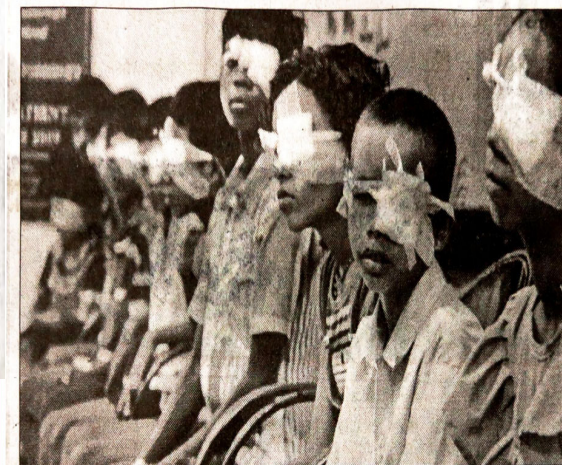
STATESMAN NEWS SERVICE Dhenkanal, 29 July