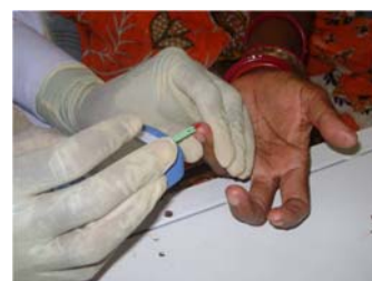
Random Blood Sugar Examination in one of the Eye Screening Camp.

screening team to provide the most effective and efficient services for our patients .