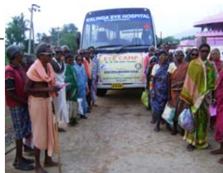
The Operated patients of the Rotary Club supported Eye Treatment camp.

have undergone the cataract eye surgery procedure at Kalinga Eye Hospital, Dhenkanal. Before the eye treatment camps, a door to door survey was also conducted by Kalinga Eye Hospital to map out the need of eye care.