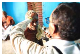
Eye Screening camp for the people residing in the MADA of Dhenkanal district.