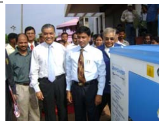
Inauguration of the Donated 20KVA DG, by H.E.- Gen M M Lakhera, Hon'ble Governor of Mizoram