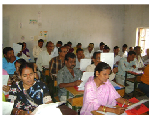
Training of the teachers on identification of children with eye problems.

1590 Anganwadi Workers & 412 School Teachers were trained to screen the children for Eye Problems.