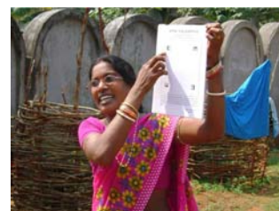
Eye Screening of children by using the E-Chart.

for the enumeration of Eye-ailment patients those who need further check-up and treatment. This novel programme envisaged and evoked great response with the grassroots level Anganwadi health-workers and was very successful.