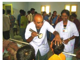
The Child Eye Screening camp at Kanteikoli seva shrama.

tensive clinics for other needy children in Dhenkanal.