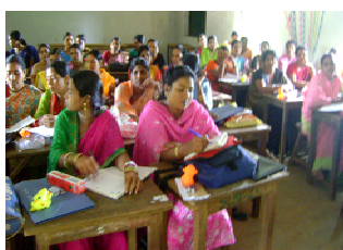
Training of the Anganwadi Workers on identification of children (0-6yrs and the school drop outs) with eye problems.

1590 Anganwadi Workers & 412 School Teachers were trained to screen the children for Eye Problems.