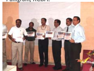
Launch of Mission Netrotsav Calendar 2010