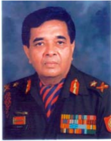
Maj. Gen. (Retd.) S . D Mahanti

Just take a moment to close your eyes and walk around. How do you feel? Help less? Disoriented? In India, blindness poses a critical public health issue and the majority of peoples' blindness is due to cataract which is easily reversible with surgery. Blindness can impair peoples' productivity and puts tremendous amount of emotional and economic burden on their families. Research has shown that blindness also reduces the peoples' lifespan. Often the barrier that prevents people from obtaining cataract surgery is the transportation or money issue.