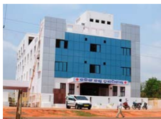
The newly made Kalinga Eye Hospital at Dhenkanal, Odisha

Since its inception in 2002, KEHRC has been providing free, high quality eye care services to poor and underserved citizens of the Angul, Bhadrak, Dhenkanal, Deogarh, Jagatsingpur, Jajpur, Kendrapara, Keonjhar and Sambalpur districts of Odisha. As a result of our efforts, thousands of poor and