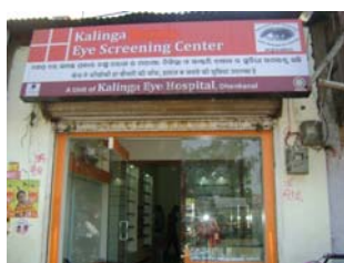
Most advanced Eye Screening Center at Angul