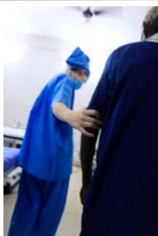
Volunteer guiding the patient in the Operation Theatre of Kalinga Eye Hospital.