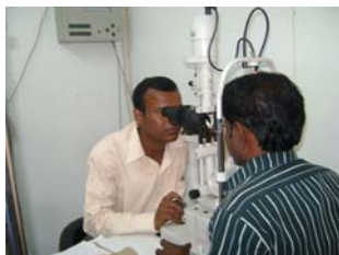
Slitlamp Bi-microscope examination at the Athagarh Center