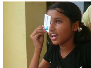
Eye Screening of School going children by the teachers.

Dhenkanal, it was well accepted and With the assistance of the Dhenkanal District Administration and Sarva Sikshya Abhiyan, Kalinga Eye Hospital conducted training programs for 412 school teachers in three different blocks of our district in 2010. The major strategies for the training was to select appropriate and interested teachers and make them understand about the importance of the