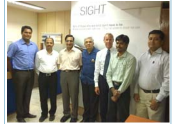
The ORBIS International, Hong-Kong and India team with the representatives of Kalinga Eye Hospital, during the meet at the ORBIS India country office.

review and planning meeting has revealed few more opportunities for developing the Paediatric Eye Care services in Orissa as the Kalinga Eye Hospital and ORBIS International have agreed to extend their support to the future Paediatric Ophthalmic related activities.