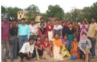
The hospital team at a cricket match.

By strengthening relationships between the staff, and working together in teams it gives everyone some time off to relax and remember the important reason everyone works so hard to eradicate the needless blindness affecting Orissa.