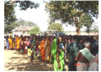
The Eye treatment camp at Kuranti

ment and an additional 137 people have cataract surgery. The reason for organizing the survey and providing the eye treatment camp was to develop the eye care provision in the seven peripheral villages of Kharagprasad, Kuranti, Kuspanga, Managalpur, Kantabania, Narendrapur, Etap.